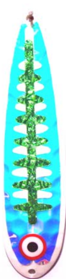
(EG-1 Green-Hex EG-1)