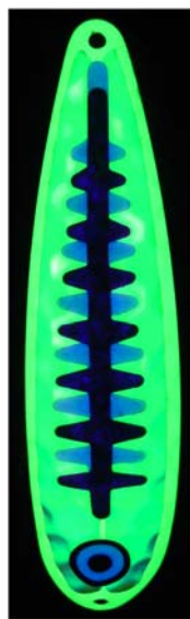
(EG-3 Orange-Hex EG-3)